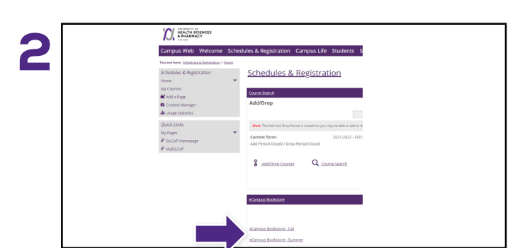
Select eCampus Bookstore and the corresponding semester you want to return for.