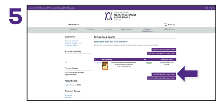
Select Print UPS Label & Complete Return to continue.