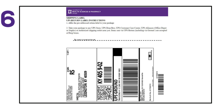
Print your free UPS label and packing slip. Insert packing slip with your rental(s) you are returning and affix label to the outside of your package. If you're on campus, drop off your package at the Student Receiving Window in the South Res Hall during regular hours. Otherwise, take it to any UPS Store.